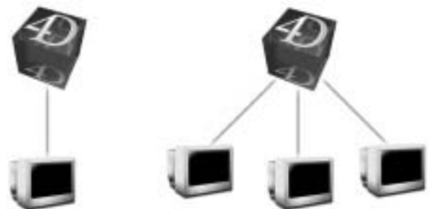
Figure 3: The same 4th Dimension system can be deployed as a single-user, multi-process application, a client/server application, or a widely distributed application.

4th Dimension's unified language can be applied to the RDBMS, Web server, Web services, and traditional client-server environments, as well as in client applications to large enterprise databases such as Oracle. This seamless integration simplifies application development and maintenance, lowering development time and lifetime costs. In fact, in a recent Ventera study, 4th Dimension was the only Web application environment studied that earned a perfect score for development time ( Table 1, page 3 ). The same 4th Dimension system can be deployed as a single-user, multi-process application, a client-server application, or a widely distributed application ( Figure 3 ). Because multi-user development and deployment is a core concept in the 4th Dimension environment, switching between single-user and client-server is typically as easy as relaunching the program. Web applications share the same language, RDBMS, data, and business logic as other environments, reducing rework and eliminating inconsistencies.